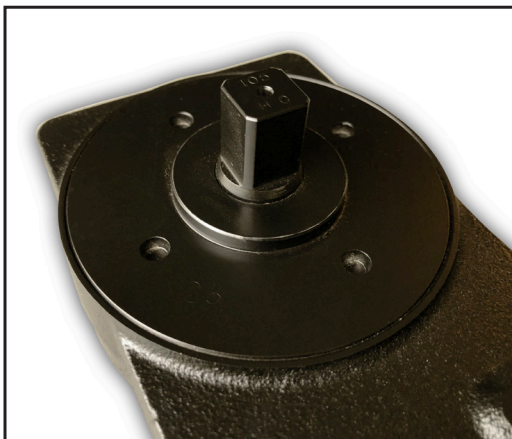
3/4" spindle length for better door support.

Center Hung Doors: Complete units for aluminum doors and frames are furnished with top arm assembly (adjustable 'S' side loading, "A" end loading, "K" end loading or "PT" end loading), adjustable dual purpose 3010-DP bottom pivot set for floor or threshold mounting (side or end loading) and 3010-FS anchor set with all fasteners.