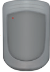
2nd Wiegand Reader (opt)