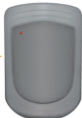
2nd Wiegand Reader (opt)