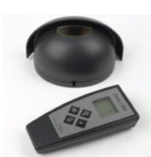
Optional weather cover and Domi-LINK Remote Control pictured.