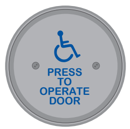
#59R6-HSS (Stainless Steel with Blue Paint Filled Legend)