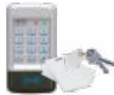
Entry Check™ 920PW