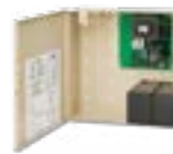
602RF 1 Amp 631RF 1.5 Amp 632RF 2 Amp 634RF 4 Amp 636RF 6 Amp

12/24VDC, Class 2 • Fire release input • System Status LED's • Multiple Fused Outputs • Multiple Relay Configurations • Universal Programmable Controllers