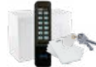
Entry Check™ 924P