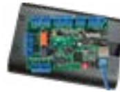
IP Pro IP-based Access Control