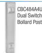
CBC484A4U Dual Switch Bollard Post