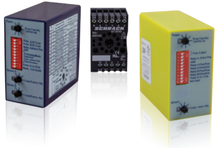
COMPACT SAFETY SYSTEM

The Matrix is a series of single or double digital inductive loop detectors for vehicle access control and safety for doors, gates, and numerous other applications. High performance features include automatic sensitivity boost, presence and pulse output selection and four frequency settings.