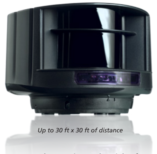
The Premium Industrial Safety Solution

The LZR®-i30, works according to the principle of time of flight. It emits a light impulse and measures the amount of time it takes to receive the impulse back. This accurate technology enables the sensor to scan 4 planes in the front of the door, which helps to significantly reduce hazards within the door threshold and surrounding area.