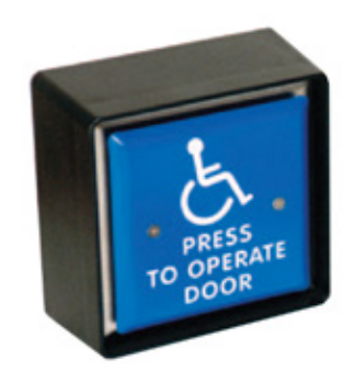
(Pictured with 59-H—Switches availableseparately or included in ClearPath Kits)