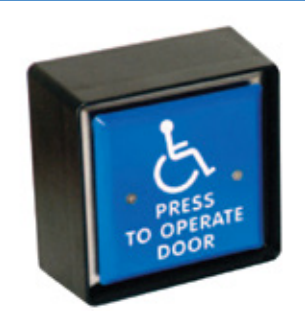
(Pictured with 59-H—Switches availableseparately or included in ClearPath Kits)