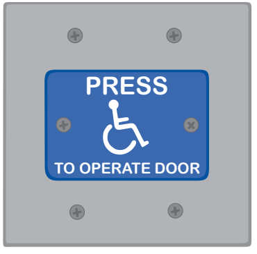
#1078-H (Anodized Blue Aluminum Face Plate with Engraved Legend)

American National Standards Institute (ANSI) - Building Hardware Manufacturers Association (BHMA) - ANSI/BHMA A156.10 & A156.19.