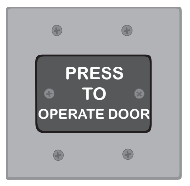
#1078-P (Anodized Black Aluminum Face Plate with Engraved Legend)